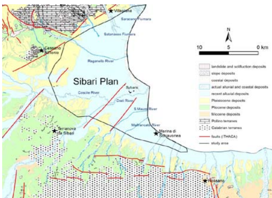
Figure 1. Geologic map of Sibari plain and study area.

The Sibari Plain is located in Northeastern Calabria Region and represents the most recent and northern sector of the Crati Basin (N-S tectonic valley controlled since Middle Pleistocene by normal faults). The evolution of Sibari Plain is controlled by NW-SE left strike-slip fault system active since Middle Miocene to Middle Pleistocene (Van Dijk et al., 2000).